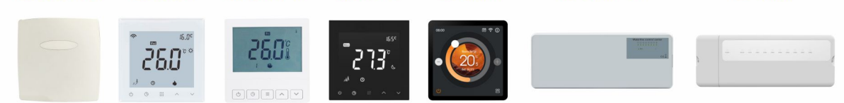
ZL-2074C ZL-2076-01 ZL-2079 ZL-2091-01 ZL-2092-01 ZL-3347-03 ZL-3348