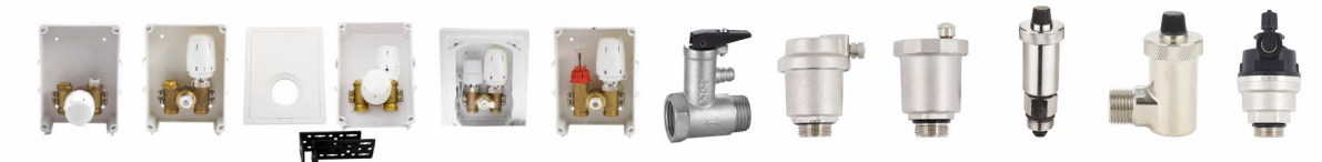
ZL-TCB -1 ZL-TCB -2 ZL-TCB -3 ZL-TCB -4 ZL-TCB -5 ZL-714 ZL-7114 ZL-7311 ZL-7313 ZL-7318 ZL-7319