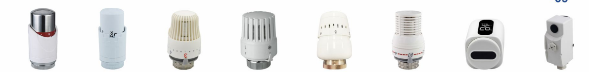
ZL-2014F ZL-2014-W ZL-2014-G ZL-2014H ZL-2014-L ZL-2014M ZL-2029 ZL-2526C -06