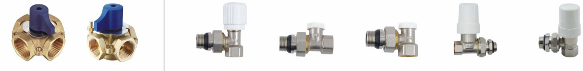
ZL-2144 ZL-2142 ZL-2458B ZL-2459B ZL-2460B ZL-2461B ZL-2462B