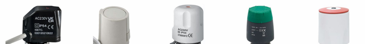
ZL-2045 ZL-2047 ZL-2041 ZL-2042 ZL-2043