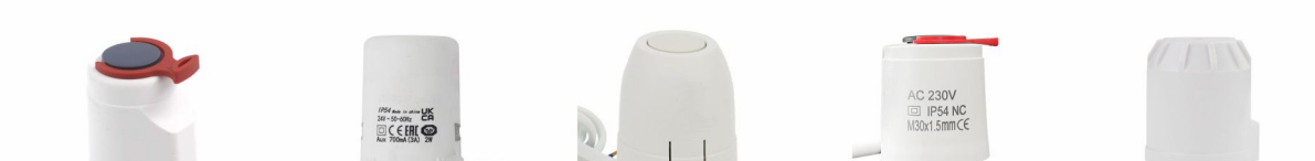
ZL-2030B ZL-2039 ZL-2035 ZL-2037 ZL-2040