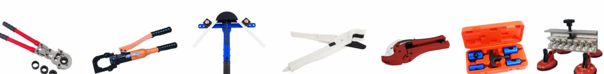
ZL-1632-A ZLS-1231-M ZLD-1432-7 ZL-1232-24-A ZL-1232-25-A ZL-1236-00 ZL-1237