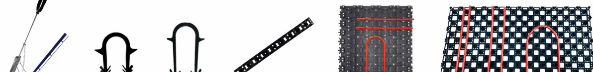
ZLS-1232-21-D ZL-1.E.200 ZL-1.E.201 ZL-KT16-00 ZL-KBX-12 ZL-KBY-16