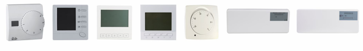
ZL-2054-01 ZL-2056 ZL-2061-01 ZL-2072 ZL-2074 ZL-3347-01 ZL-3350