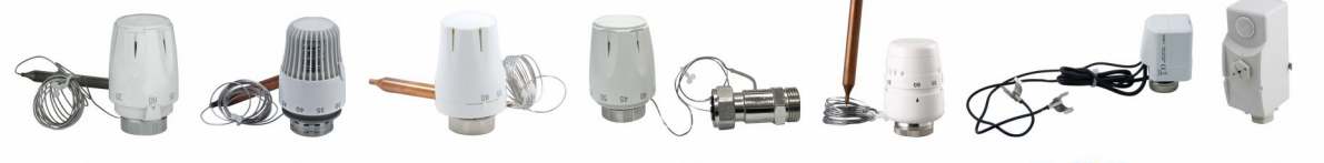
ZL-2014A ZL-2014K ZL-2014V ZL-2014X WKT-101 ZL-2046 ZL-2526C -03