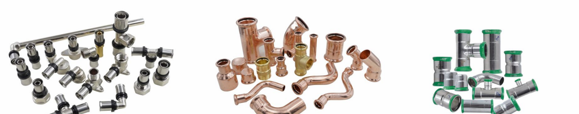
MLCP press fitting type: U-B-TH-H 16-32 mm Copper press fitting type: M profile 15-54 mm Stainless steel press fitting type: M profile 15-54 mm