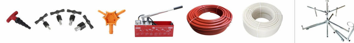
ZLD-1232 -14 ZL-1233-16 ZL-1233 ZL-RP-50 BTXB 16/20 /25/32 CZRA 16*2.0 ZL-1235G-00