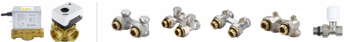
ZL-2131 ZL-2143 ZL-E0017 ZL-0017A ZL-E0018 ZL-E0021 ZL-2457B