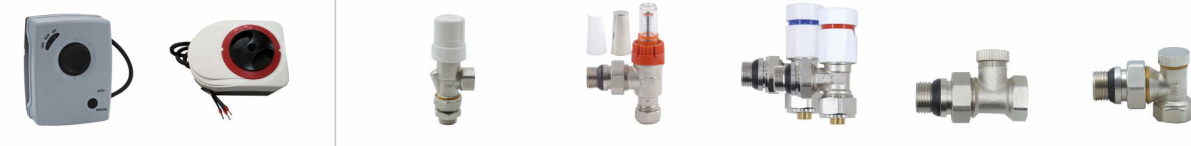
ZL-2066 ZL-2050 ZL-2463B ZL-2465 ZL-2466S ZL-2321C ZL-2322C