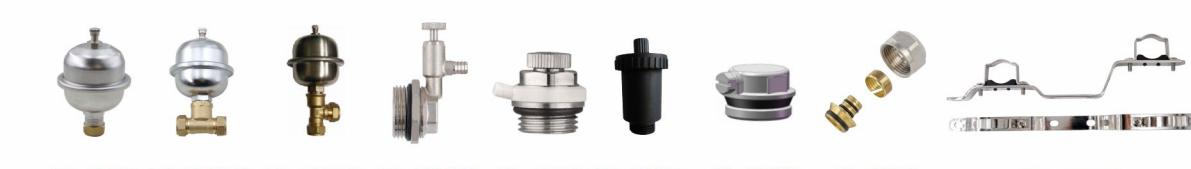
ZL-7327 ZL-7327S ZL-7327L ZL-7325B ZL-7329 ZL-7330 ZL-7333 ZL-1128