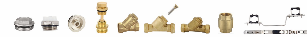
ZL-9111 ZL-9902 ZL-1119 ZL-1121 ZL-7111 ZL-7113B ZL-7113C ZL-7004B ZL-1175K