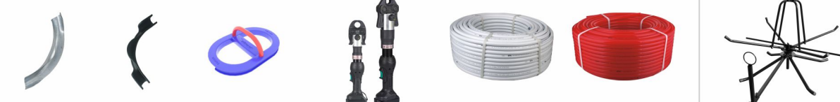
ZLX-1232 -16/20 ZL-WK01 -16/20/25 ZL-WK03 -16 ZLX-4064/4065 15-32mm/15-54mm BWRB 12/16 BGRD 10/12 /16/20 ZL-1235E