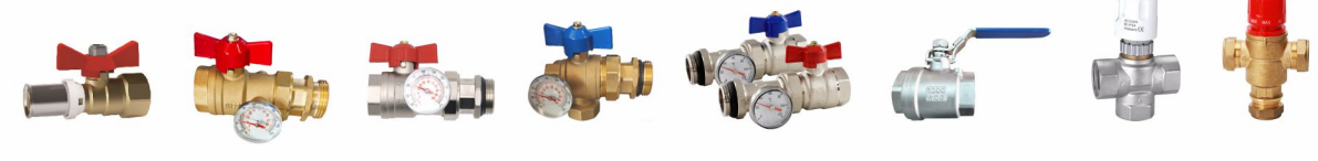
ZL-4223B ZL-4228 ZL-4228S ZL-4229 ZL-4729 ZL-S8606 ZL-2251 ZL-2570