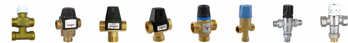
ZL-2615 ZL-2543 ZL-2577 -MMM ZL-2577 -FFF ZL-2611 ZL-2582K ZL-2132 ZL-2138