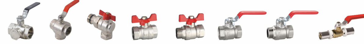
ZL-4197 With filter ZL-4236 With magnet filter ZL-4206 ZL-M200A -FF ZL-M200A -FM ZL-M201A -FF ZL-M201A -FM ZL-4223