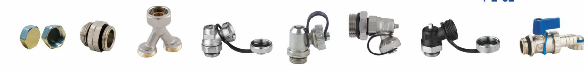
ZL-9115 ZL-9214 ZL-9217 ZL-2861 ZL-2864B ZL-2861C ZL-4245 ZL-4247