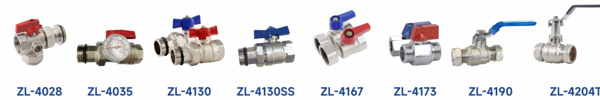
ZL-4028 ZL-4035 ZL-4130 ZL-4130SS ZL-4167 ZL-4173 ZL-4190 ZL-4204T