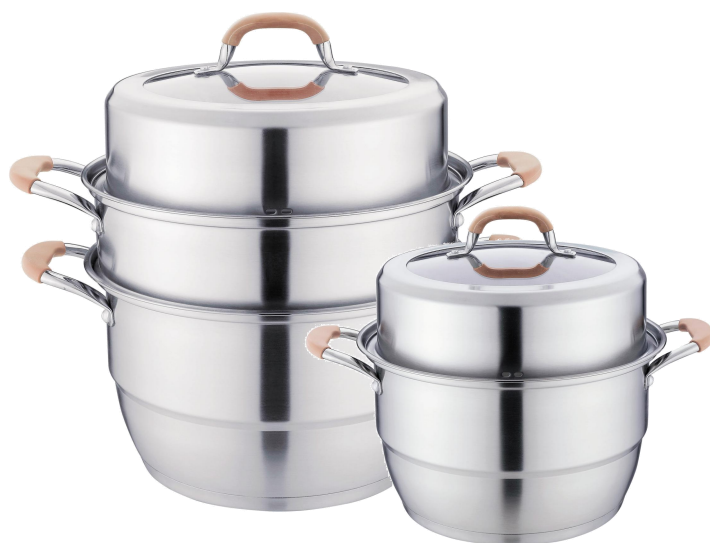
WH-CD008 Size: 28/30/32/34/36 cm (304 SS)