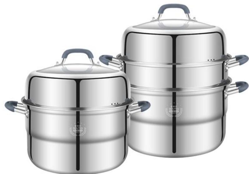
WH-CA005 Size: 28/30/32 cm (Tri-ply 304 SS)