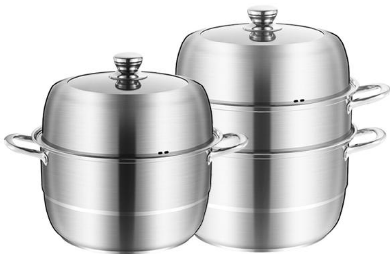
WH-CD007 Size: 28/30/32 cm (201SS)