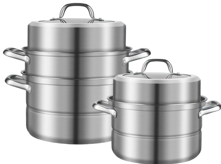
WH-CA006 Size: 28/30/32 cm (Tri-ply 304 SS, Lid & Steamer 201SS)