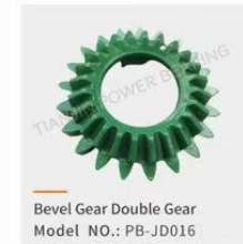
Bevel Gear Double Gear Model NO.: PB-JD016