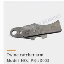
Twine catcher arm Model NO.: PB-JD003