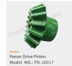
Feeder Drive Pinion Model NO.: PB-JD017