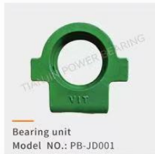
Bearing unit Model NO.: PB-JD001