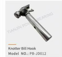
Knotter Bill Hook Model NO.: PB-JD012