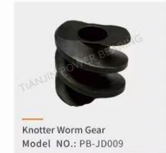
Knotter Worm Gear Model NO.: PB-JD009