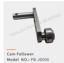
Cam Follower Model NO.: PB-JD006