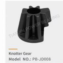
Knotter Gear Model NO.: PB-JD008