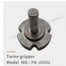
Twine gripper Model NO.: PB-JD002