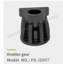
Knotter gear Model NO.: PB-JD007