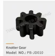
Knotter Gear Model NO.: PB-JD010