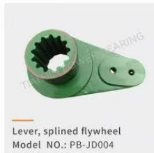
Lever, splined flywheel Model NO.: PB-JD004