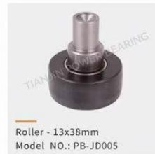
Roller - 13x38mm Model NO.: PB-JD005