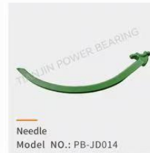
Needle Model NO.: PB-JD014