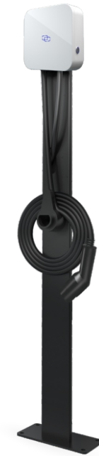
Floor Mounting with Pole