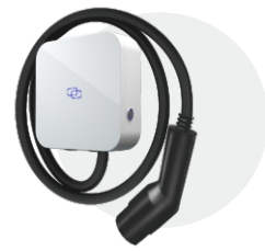
Wall mounting with Cable Organiser