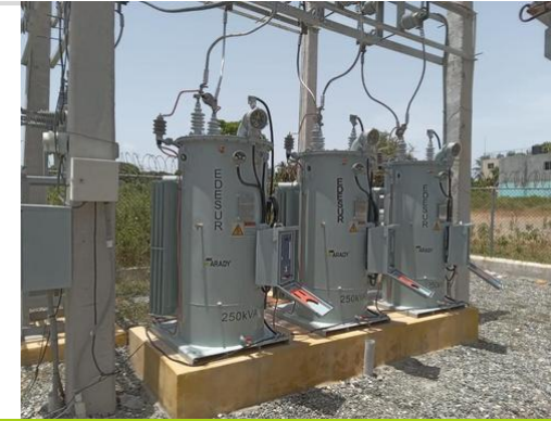
Dominica Republic EDESUR