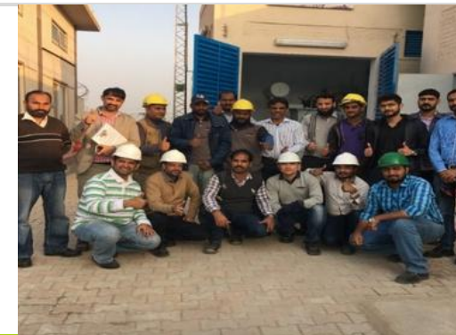
Pakistan Philip Morris