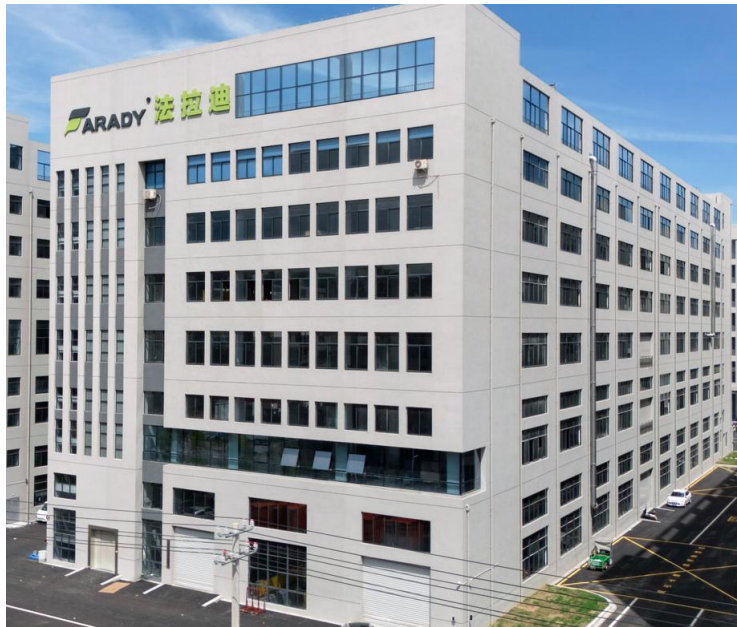
FACTORY ADD:NO. 13, HIGH-TECH INDUSTRIAL PARK, YUEQING , WENZHOU CITY, ZHEJIANG PROVINCE,CHINA

Founded in 2006, with 45 million USD turnover per year now , Farady Electric enjoys about 20 years experience in medium voltage section. FARADY Focus on Power transformer/Regulator/ Switchgears manufacturing with KEMA/ASTA/UL certification.