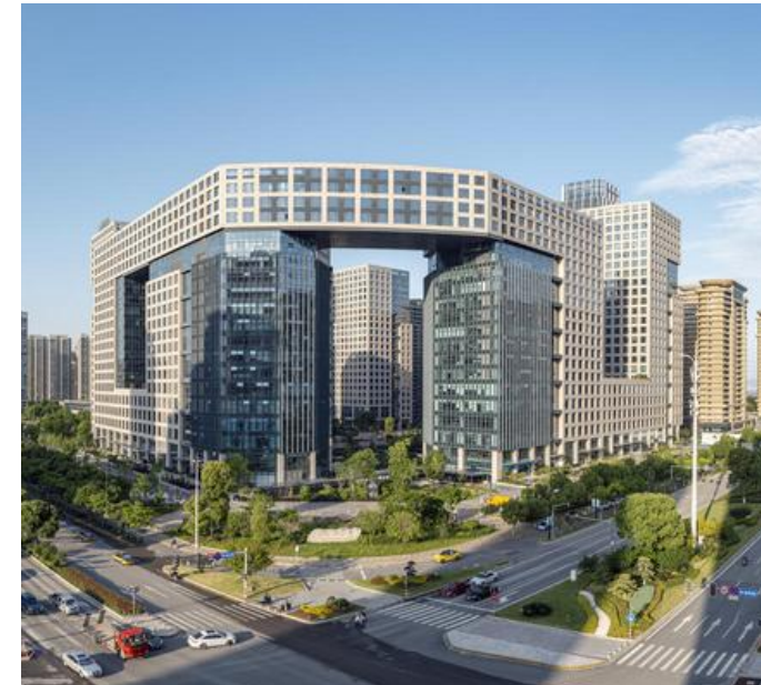
OFFICE ADD: 702#, NO. 6688, XUYANG RD, CHENGONG STREET, YUEQING CITY, ZHEJIANG PROVINCE, CHINA