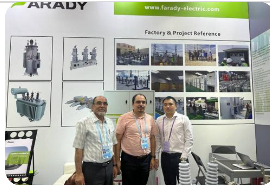
Canton Fair Show