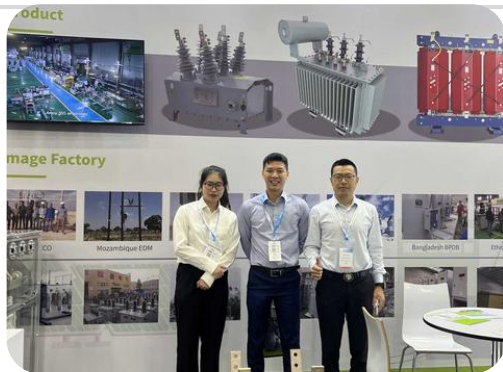
Malaysia Tenaga Expo