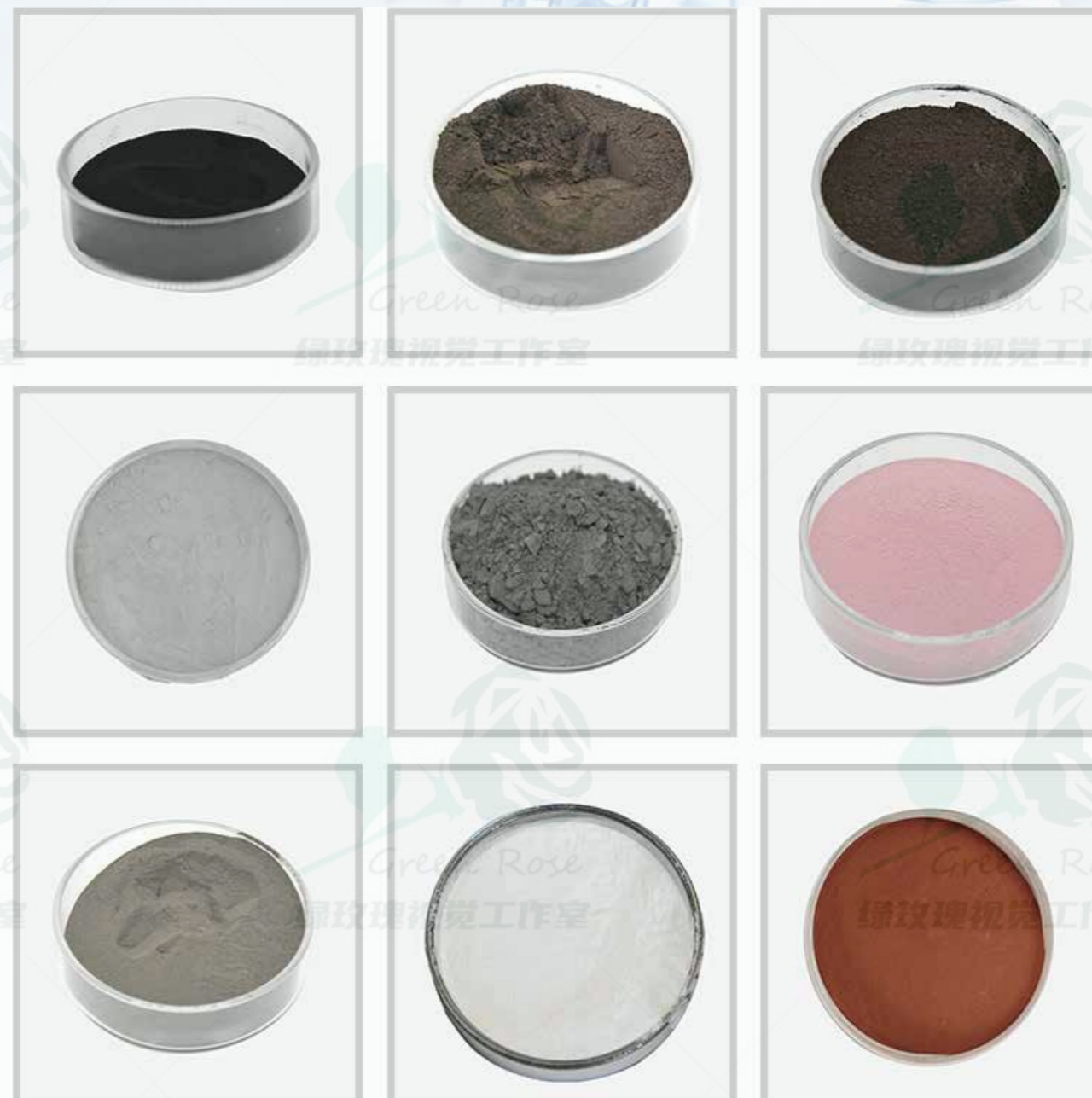
金属粉末 Metal Powder