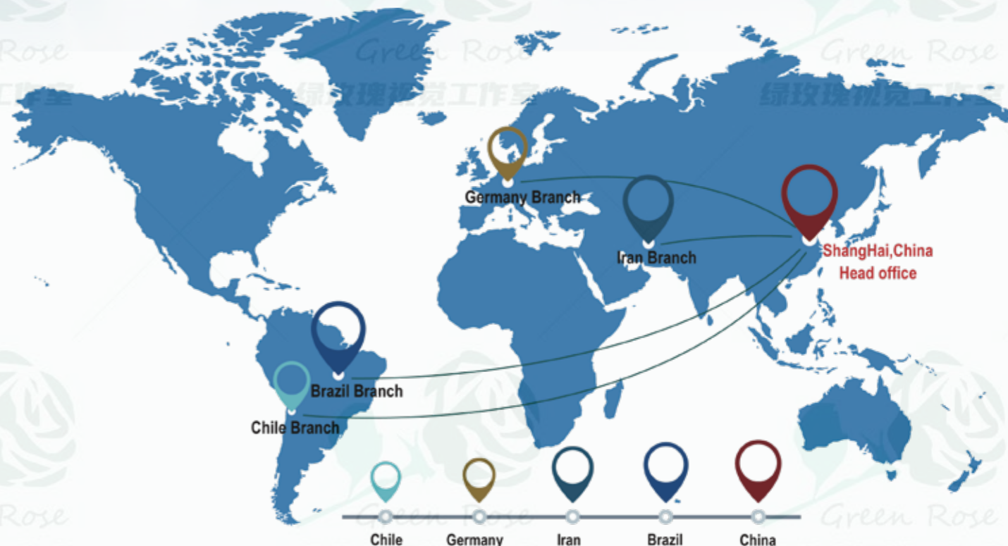
Chile Germany Iran Brazil China