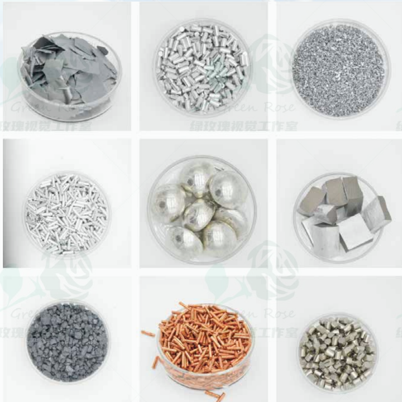
金属颗粒 Metal Particle