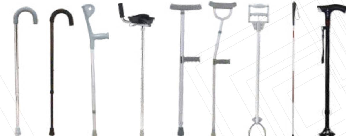
TWA9281L TWA9280L TWA937L TWA9204L TWA925LA TWA925LB TWA583 TWA936L TWA001