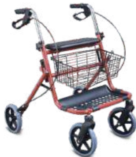
» TWA914H-1 (NEW)