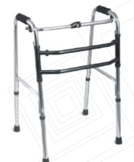
» TWA9152L (NEW)