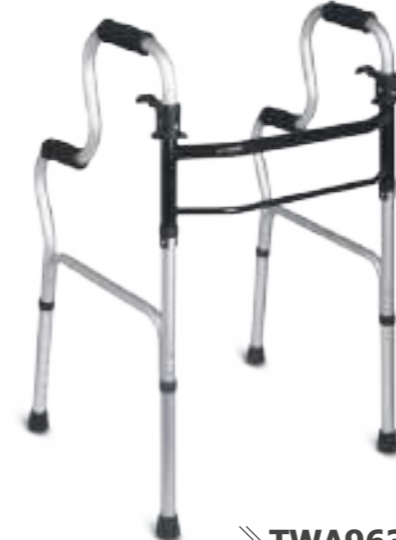
» TWA9637L (NEW)