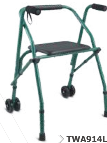
» TWA914L (NEW)