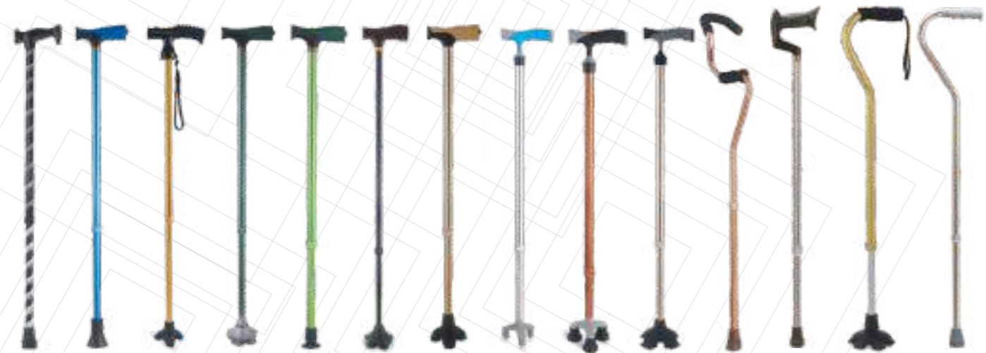
TWA9391L TWA9301L-4 TWA9301L-1 TWA9301L-2 TWA9301L-3 TWA9274L TWA9208L TWA9207L-3 TWA9207LW-2 TWA9207LW-1 TWA9304L TWA9300L TWA9382L TWA928L