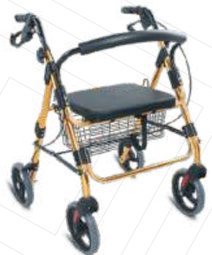
» TWA965LH-A (NEW)