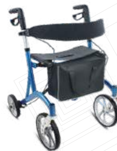
» TWA9862LH (NEW)