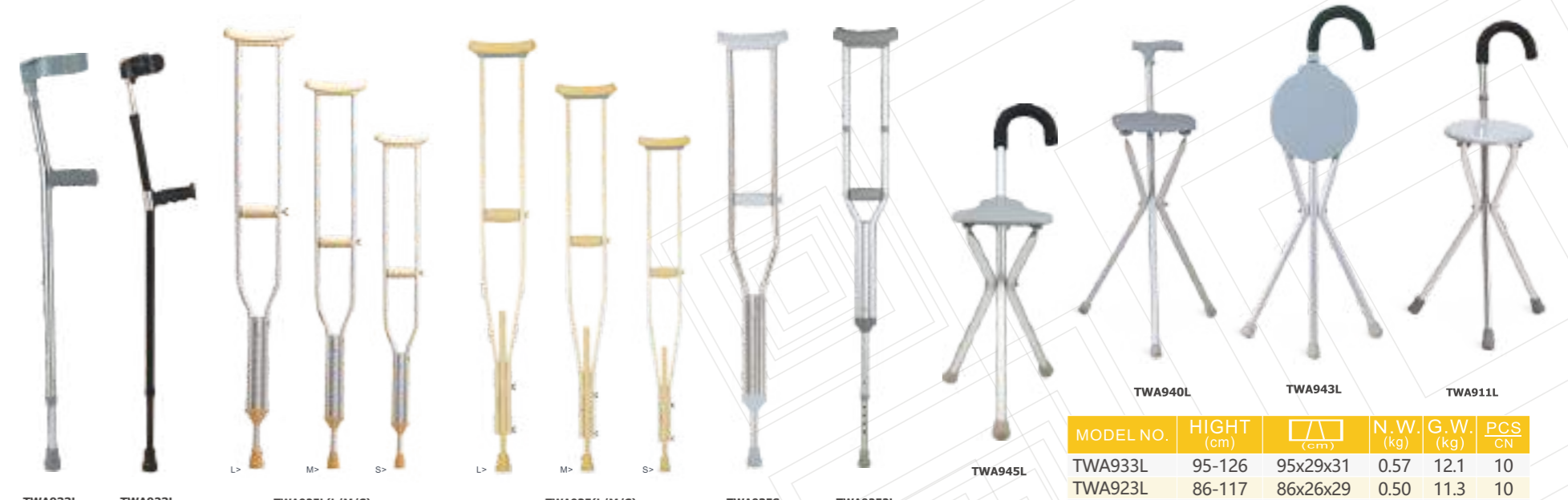
TWA933L TWA923L TWA925L(L/M/S) TWA935(L/M/S) TWA935S TWA9252L TWA945L