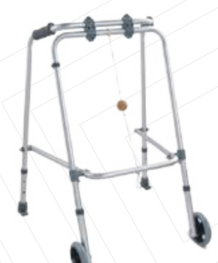
» TWA9171L (NEW)