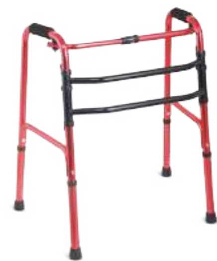
» TWA9151L (NEW)