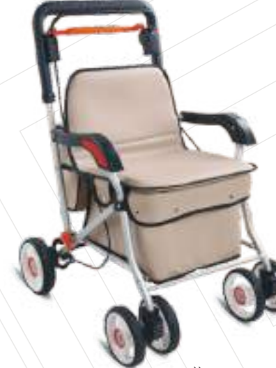
» TWA9865LH (NEW)