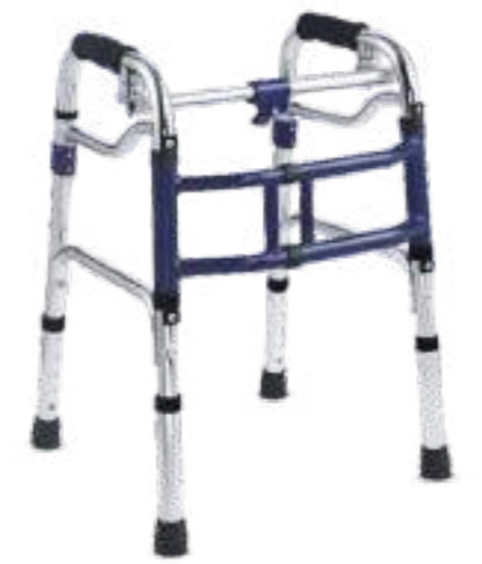
» TWA9503L (NEW)