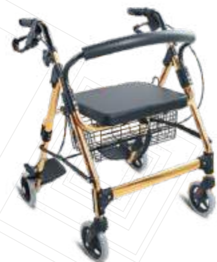
» TWA966LH-B (NEW)