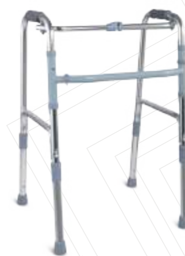
» TWA9134L (NEW)