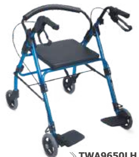
» TWA9650LH (NEW)