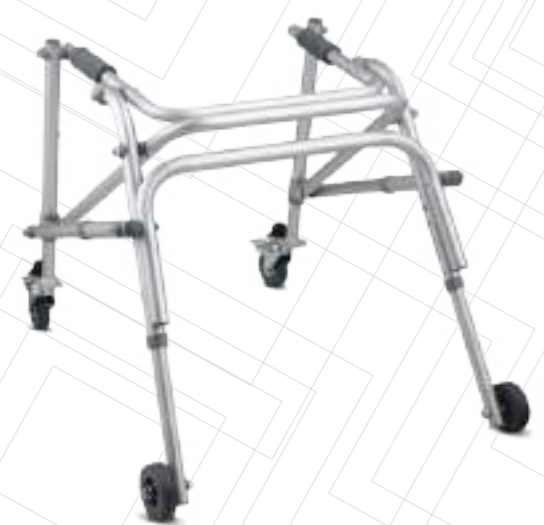
» TWA9123L(S)-B (NEW)