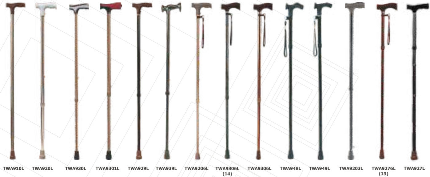
TWA910L TWA920L TWA930L TWA9301L TWA929L TWA939L TWA9206L TWA9306L (14) TWA9306L TWA948L TWA949L TWA9203L TWA9276L (13) TWA927L