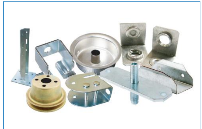
Stamping and Welding