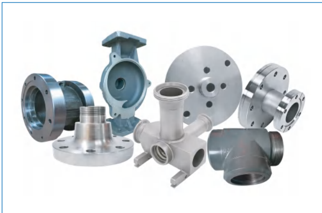
Valve & Fittings