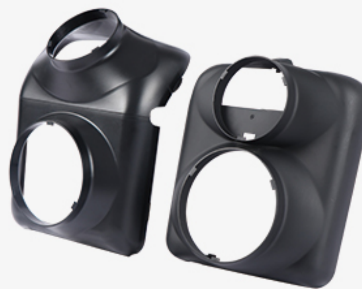
Air Pipes Holder*2