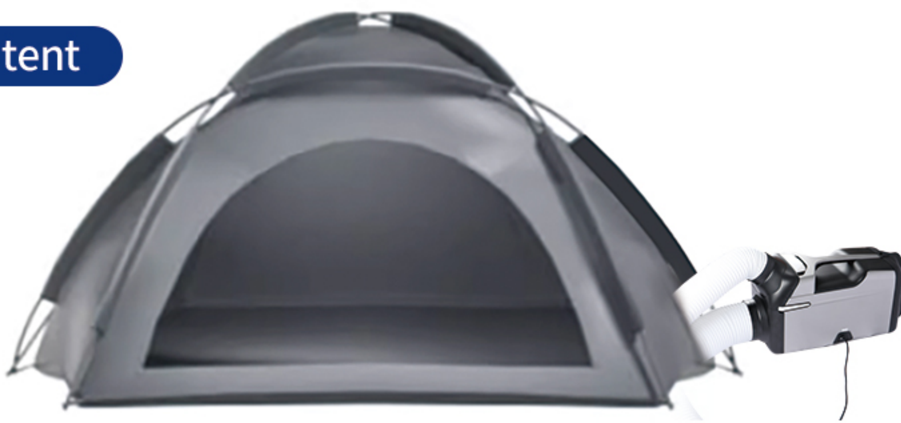
Place outside the tent

Install pipes to cooling air outlet and inlet, place the AC outside the tent, saving rooms and reducing noise.