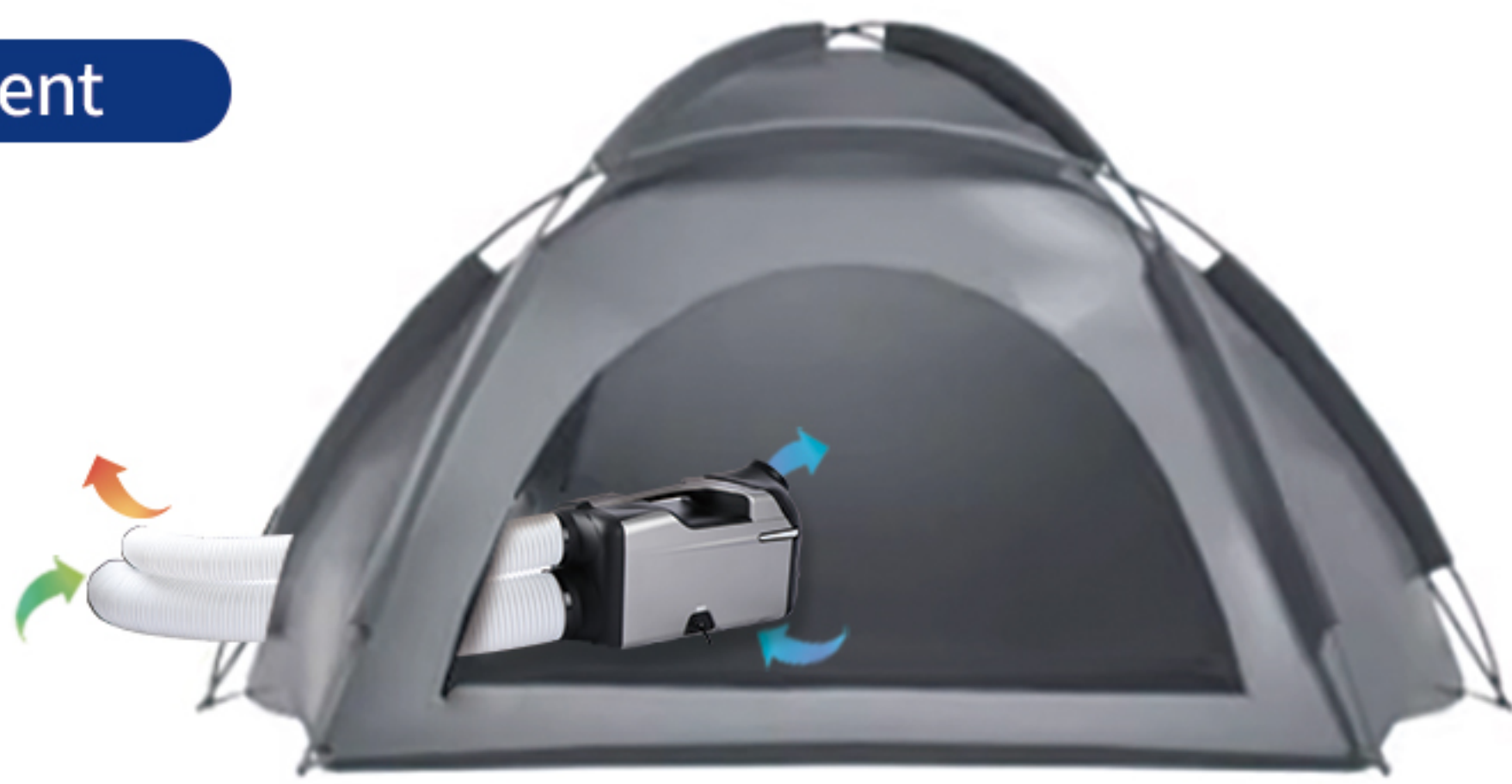
Place in tent

Ventilation inlet and outlet installed with pipes, to cool down tent air faster and anti rain.