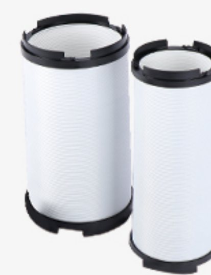
Flexible Air Pipe*2